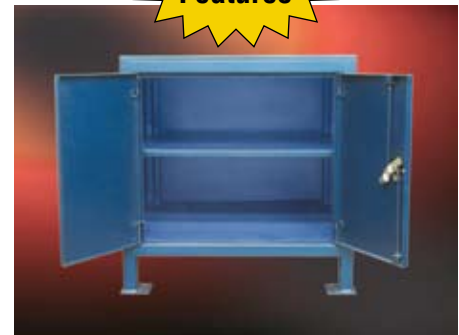
Lockable Tool/Accessories Storage Cabinet