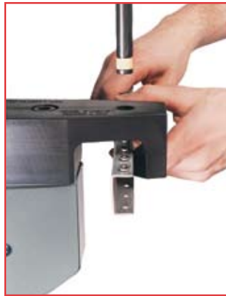
Bottom Mount Reverse Flange Anvil Holder.