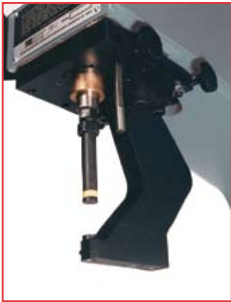
Top Mount Reverse Flange Anvil Holder includes punch and anvil.

Optional anvil holders and tooling can be easily installed on all new and existing PEMSERTER® Series 4® presses.